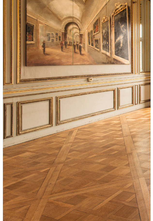
1 final coat for domestic work.