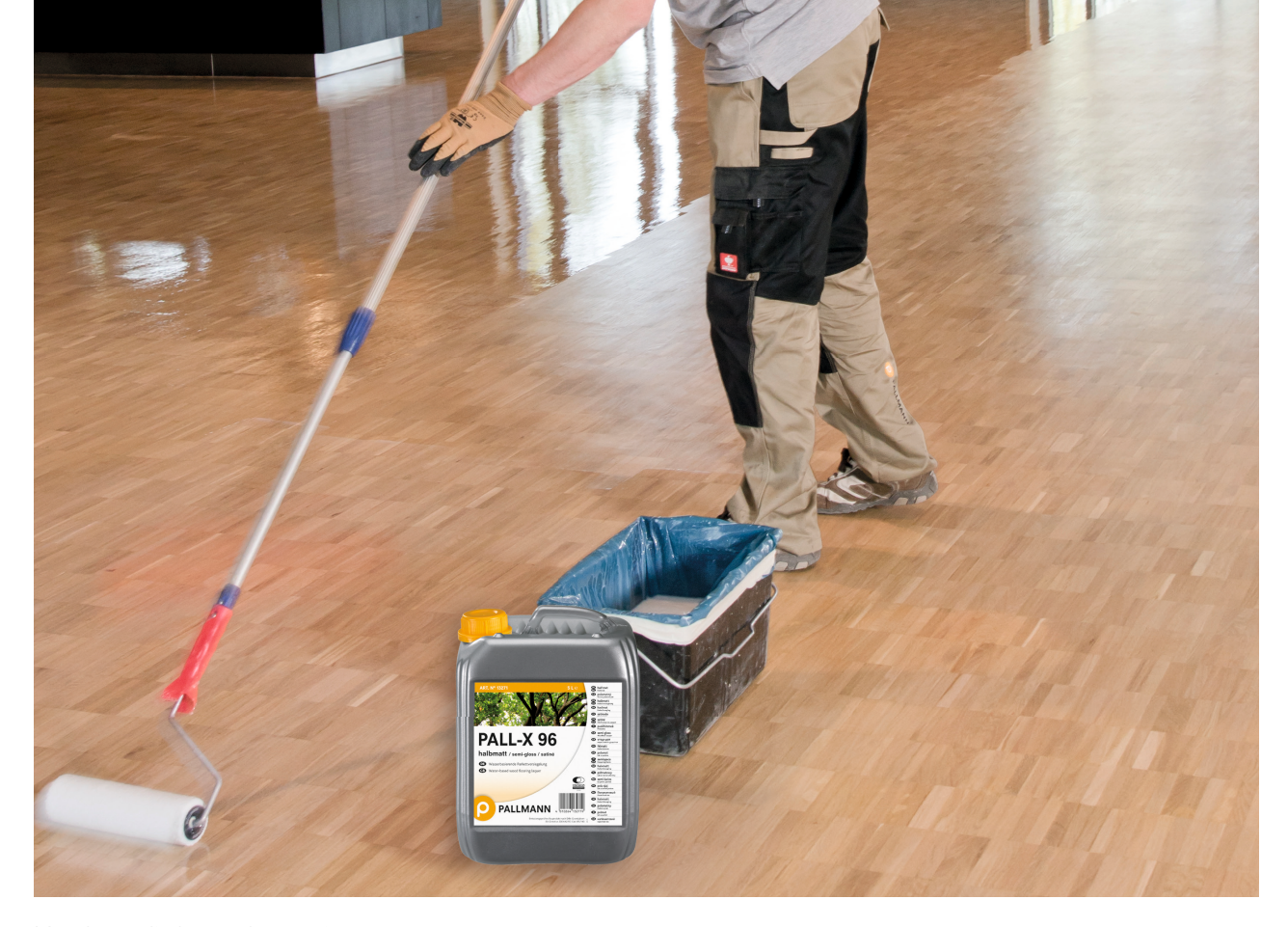
Must be applied same day as primer.